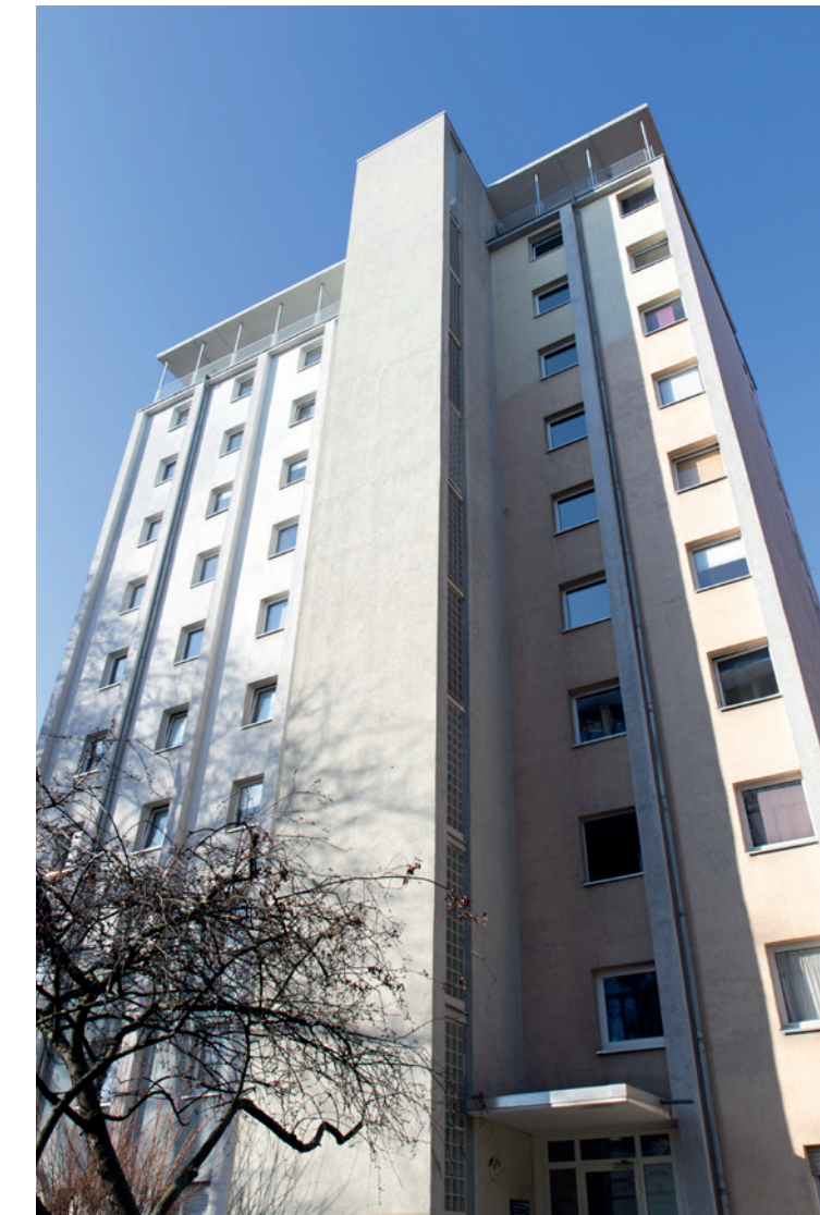
In the middle of urban life: Hermann-Heimerich-Haus N6.

Was the application for an accommodation not successful? Then take a look at www.gib-bildung-ein-zuhause.de . There you can find information about private accommodations and information about our "Wohnen für Hilfe" project.