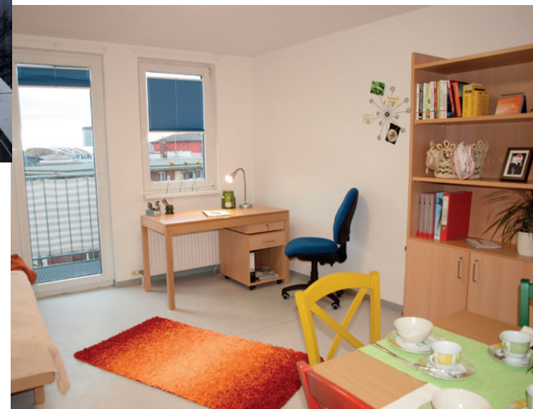
"Home Sweet Home!" in the Parking.

Whether it is an apartment or a single room in a residence hall, a traditional working-class neighborhood or an upscale suburb, the Studierendenwerk has an offer for every need. New Mannheimers can enjoy life in a vibrant community; making contacts and first experiences are easily to be found in the shared kitchens.