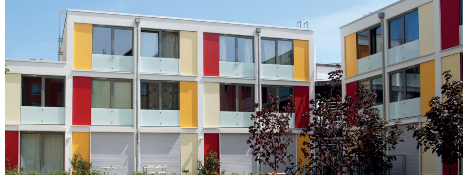
Stylish and comfy: the apartments of B7.

We are able to provide about 3,000 students accommodations in 16 various student residence halls. Everything from eco-friendly housing in the "Eastside" complex to the microcosm of the former military site in the Neckarstadt to the rooftop apartments of the Augartenstraße or the refurbished and trendy accommodations in the Hafenviertel.