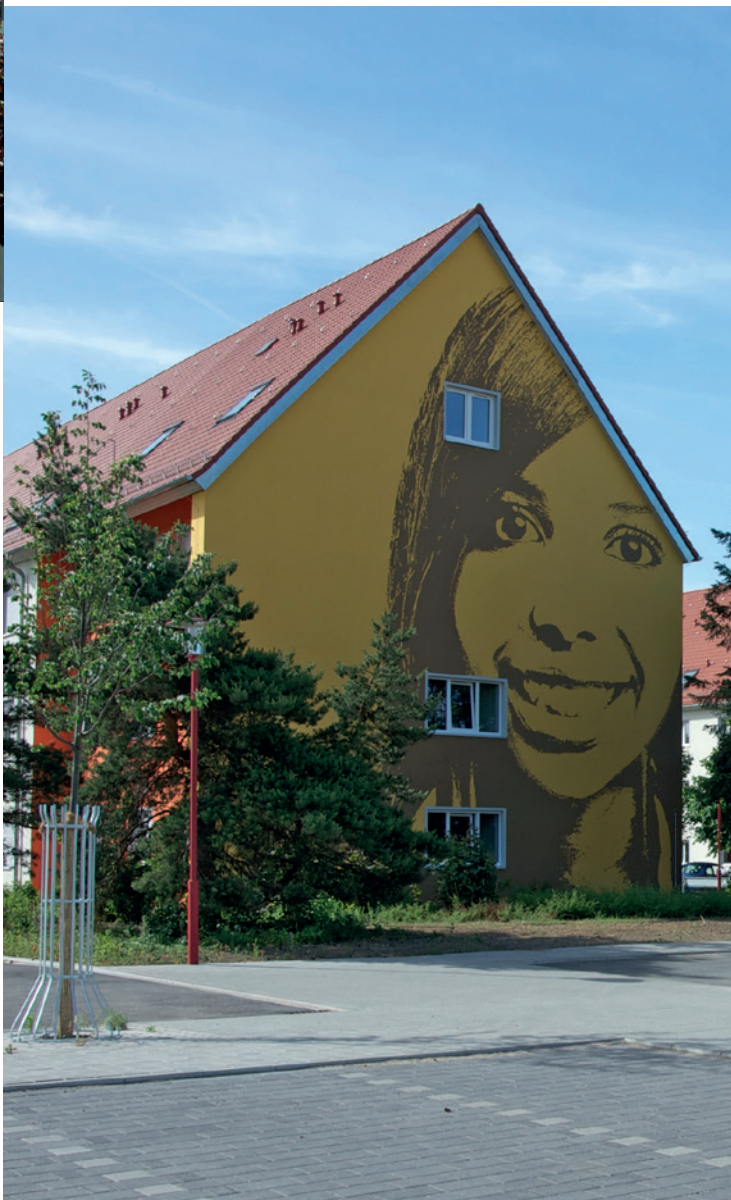
Stud.-Siedlung Ludwig-Frank mit über 700 Wohneinheiten.

So the students can fully concentrate of their studies, the Hausbetreuung services are included. They will help when moving in, make repairs, and make sure that the accommodation is functioning all the year round.