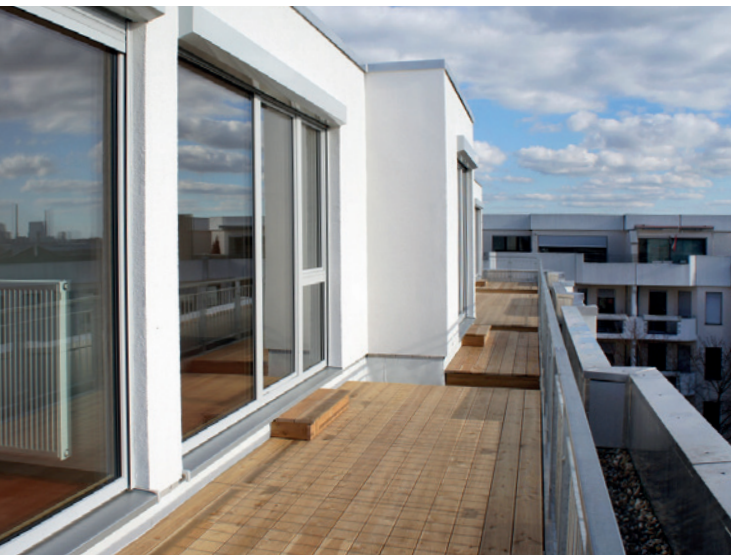
Rooftop-Apartments above the roofs in Mannheim

At the same time you can concentrate on your studies in the peace and silence of your own room. The Studierendenwerk also offers accommodations for students with children or handicapped students.